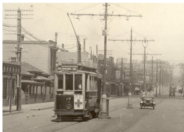
Above – Tram 17 Adelaide Road.

On October 22 nd we received confirmation that WTM has been awarded a lotteries grant of the full actual amount we were seeking towards the restoration of the body of Combo 17, by professional restorers the Wheelwright Shop of Gladstone (the people who did the restoration of Grip Car #3 at the Cable Car Museum), in accordance with our Conservation Plan.