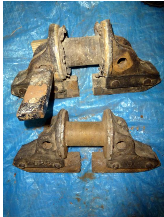
Two (of the four) magnetic brake assemblies for tram 260. The old wiring has been removed and preparations are being made to rewind them on site.

Overall sound progress – remaining tasks are significant however and include completing the two cabs, preparing and fitting the various remaining components both within the tram (such as the windscreen wipers, and advertisement board brackets) and underneath the tram, continuing the wiring, completing the air system, painting the tram's exterior, and focusing work on the two trucks (including rewinding of the magnetic brakes).