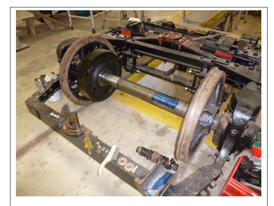
The "A" end truck for tram 260 (ex tram 235) with motor removed and showing the driving axle

A replacement bearing for the commutator end was found from the Museum's stock of spares but we are still trying to source a drive end bearing.