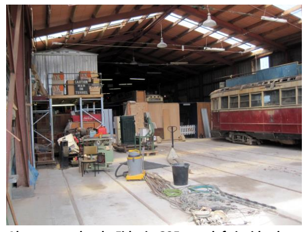
Above: ...and only Fiducia 235 was left inside the storage and office area of the barn.