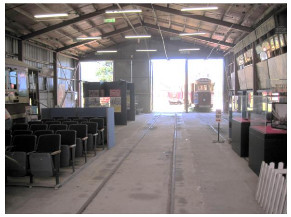
Above: The only tram left in the public area was Brisbane 133 (King-Kong tram) on the far left.