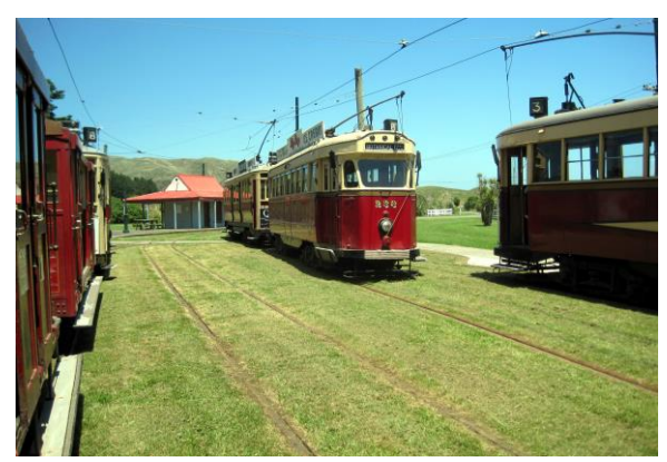
Above: Tram 159 towed out 238