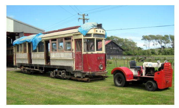
Above: Tram 207 was towed outside using the "Tug".

On Christmas Eve, 24<sup>th</sup> December, Mike Vash performed the annual ritual of cleaning out as much of the barn as possible, in preparation for the anticipated influx of visitors over the holiday period. This involves moving some of those vehicles that normally remain inside the building, outside