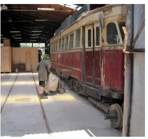
Above.....leaving space for Mike's cleaning operations!