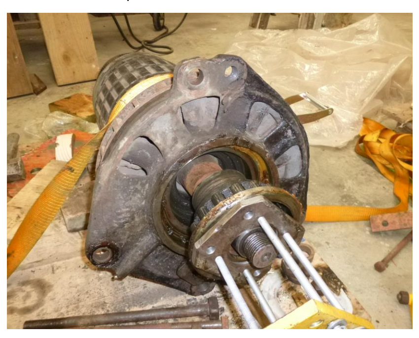
The bearing on the pinion end of the motor was most resistant to removal – shown here finally removed on 4^{\rm th} January.

Dismantling the BTH motor to access the bearings proved to be a more difficult task than anticipated. This was due to the need for several custom tools which were not available and had to be made. The tapered sleeve which carries the inner race on the pinion end was the most resistant. This