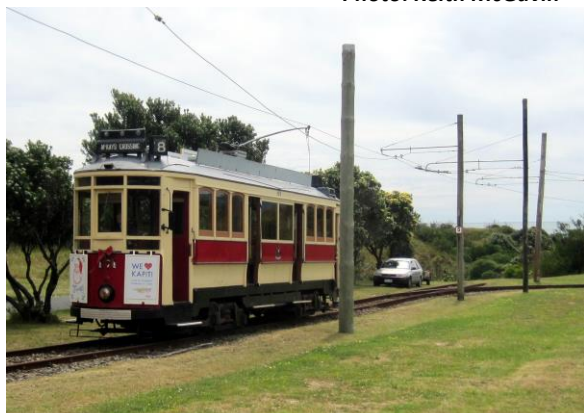
Above: Tram 151 makes its way towards the summit during its ascent from the Beach terminus, 20<sup>th</sup> December 2014.