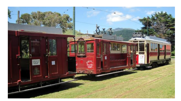
Above: Tram 151 (4 foot gauge) assisted in hauling out the cable car and trailer (each 3ft 6" gauge) on our multi-gauge track.