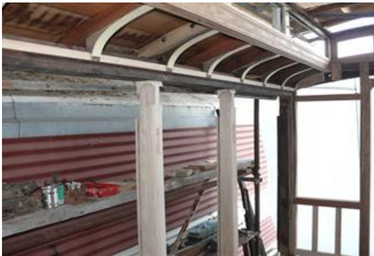
New trim at base of clerestory