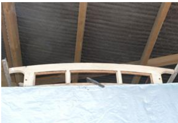
Existing clerestory end above motorman's cabin

No. 17 was constructed in the United Kingdom and came to New Zealand in CKD form.