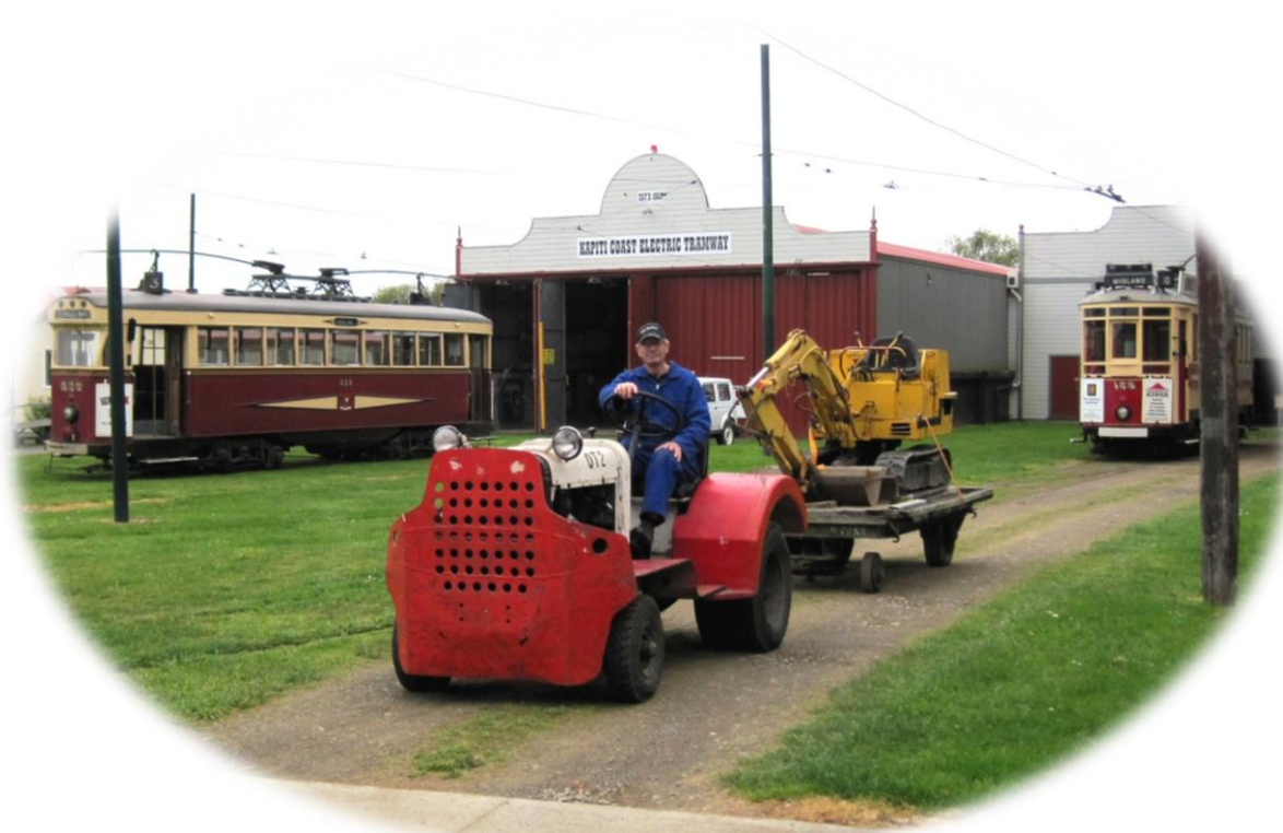
Above: Our “new” old excavator transport. The ex Wellington Harbour Board Tug and trailer have been pressed into service to provide a means of transporting the excavator around the tramway.