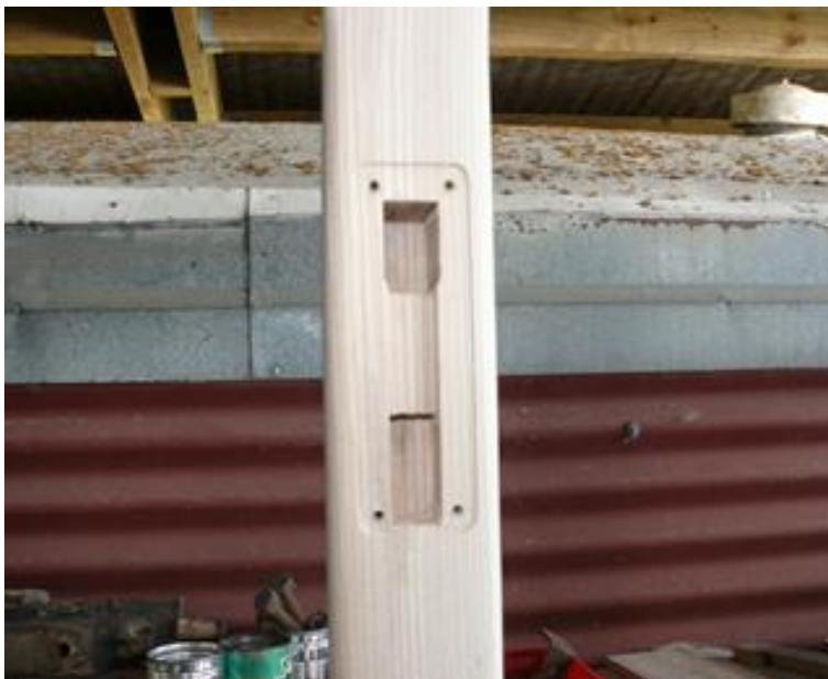
Cavity for barrier retaining latch