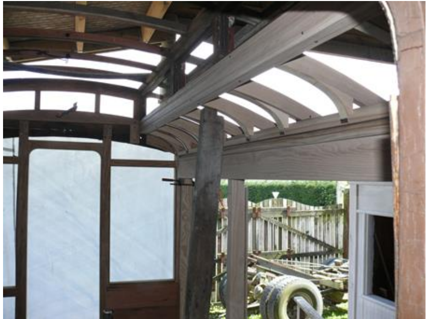
Completed roof section showing new bows and moulding attached

Since our visit on 8 August, considerable progress has been made with the fabrication of new pillars, cant rail and quarter bows on the open section side that had been completely removed when 17 was turned into a holiday house in Raumati South.