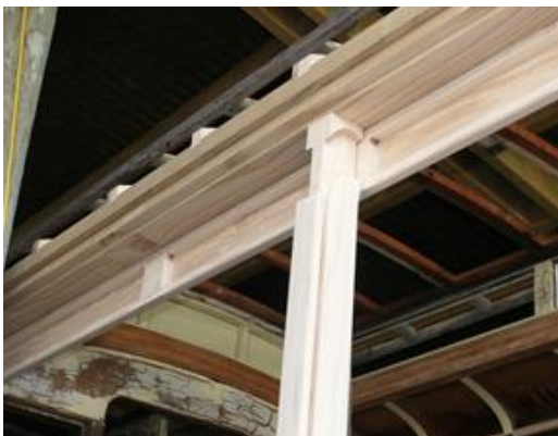
Inner fascia board showing blind cavity