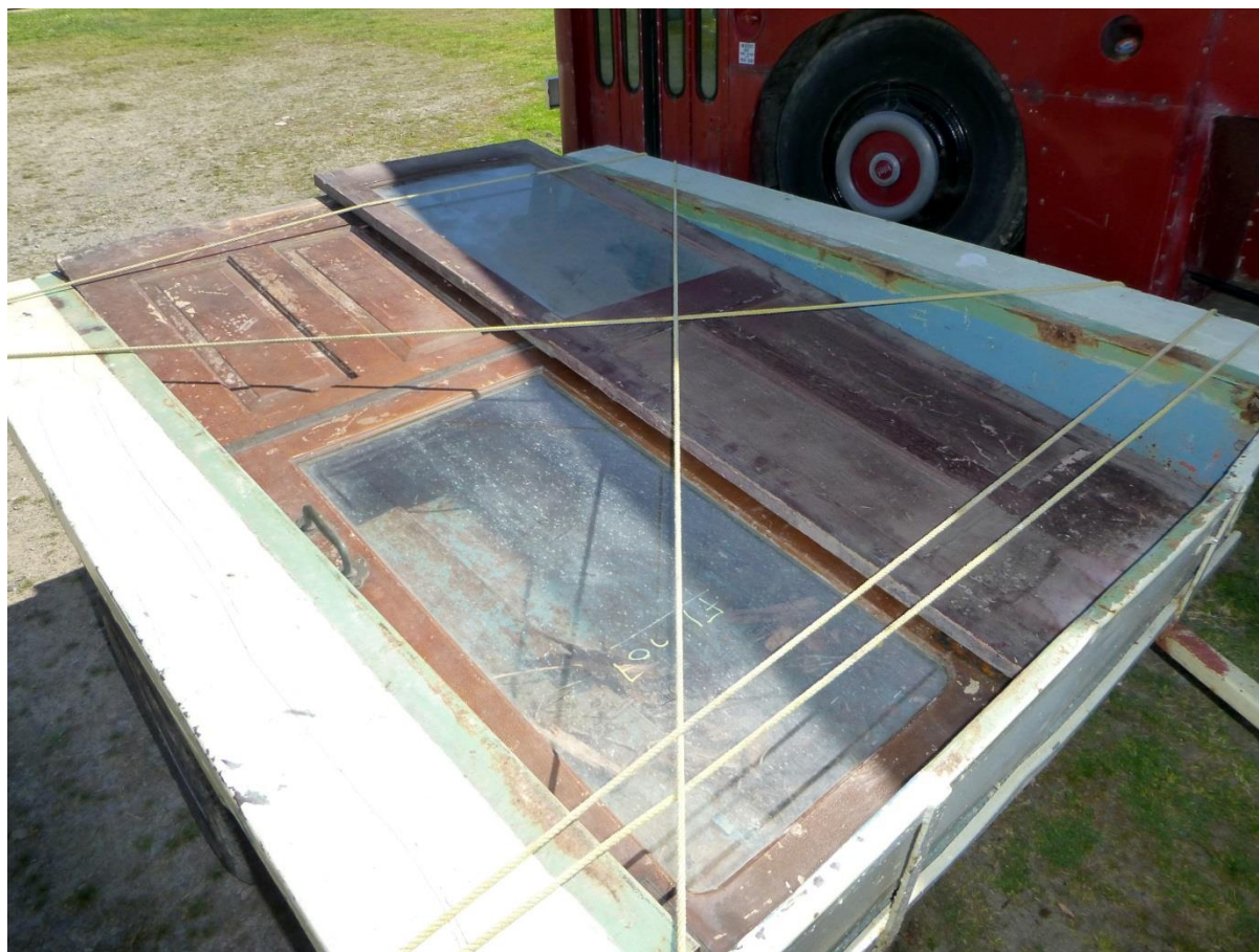
Above: Two sliding doors from our stock (ex trams that were “dismantled” by members in the 1970’s) loaded on to Henry Brittain’s trailer for transport to Gladstone where they will potentially be used in the restoration of tram 17.

If you would like to make a donation please send a cheque to the Wellington Tramway Museum at P O Box 2612, Wellington 6140, or alternatively credit our bank account via internet banking at ANZ Bank, account No. 06 0501 0075414 00 indicating in the reference field what the payment is for. A receipt will be sent and remember, your payment is a charitable donation and therefore qualifies for a tax rebate.